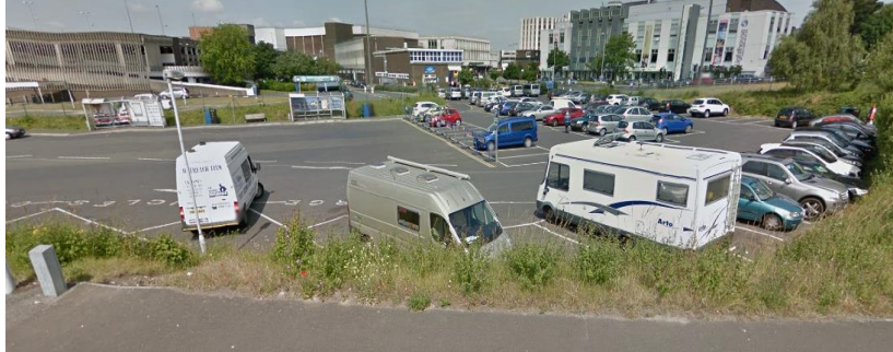
Seldown car park